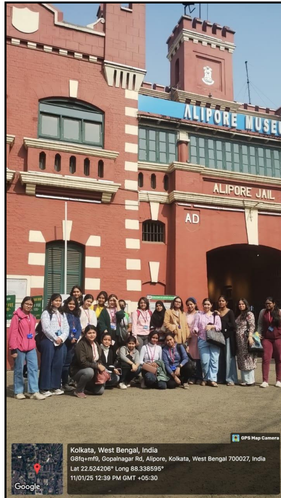
Group Photo of Students at Entrance of Alipore Jail Museum