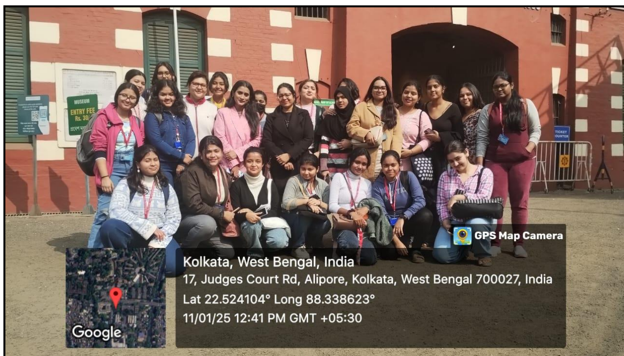
Group Photo at Entrance of Alipore Jail Museum

Students found the study tour helpful in uplifting their mood & spirit. Though this excursion did not have any direct relevance to their coursework, spending quality time with friends and teachers outside of the academic setting brought them immense joy. Moreover, they gained valuable insights into our country's struggle for independence, making the experience even more enriching. Students informed us that they look forward to college/department organizing similar excursions/ visits/ outings/ picnics in the future, fostering camaraderie and enthusiasm among them.