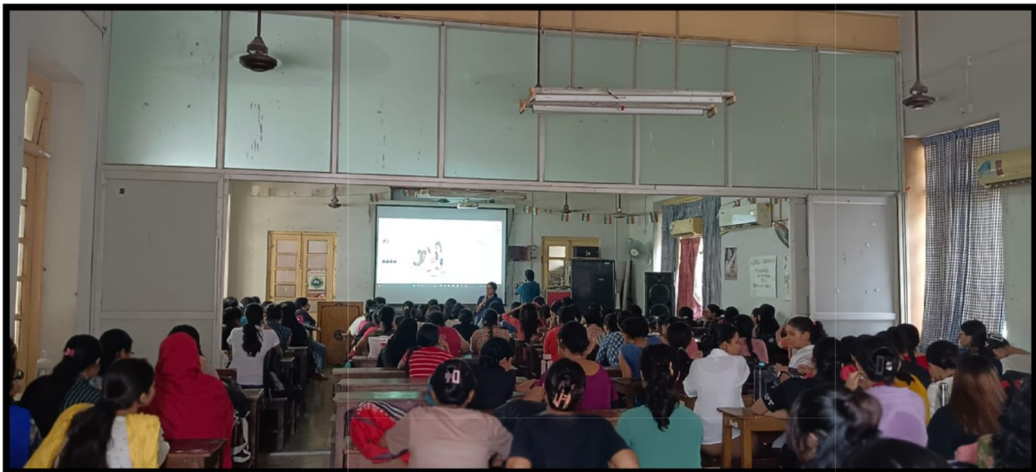
Pictures of Psychometric Career Counseling Awareness program for the students on 10.5.23