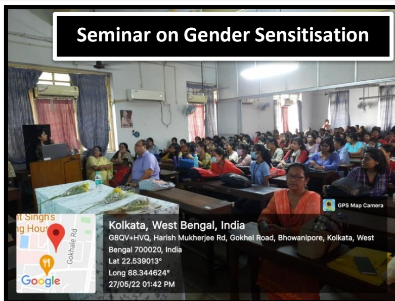
Seminar on Gender Sensitisation