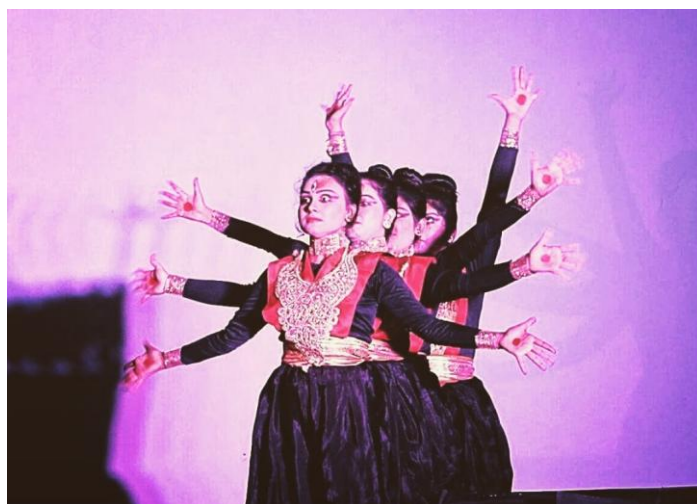
College Day Cultural Programme 2017