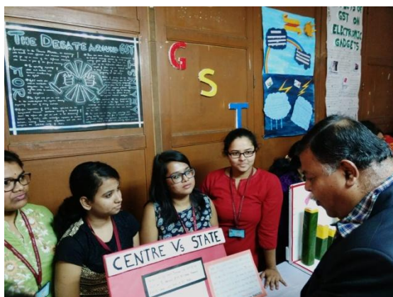
2 nd Year students at the Annual Exhibition, 2017