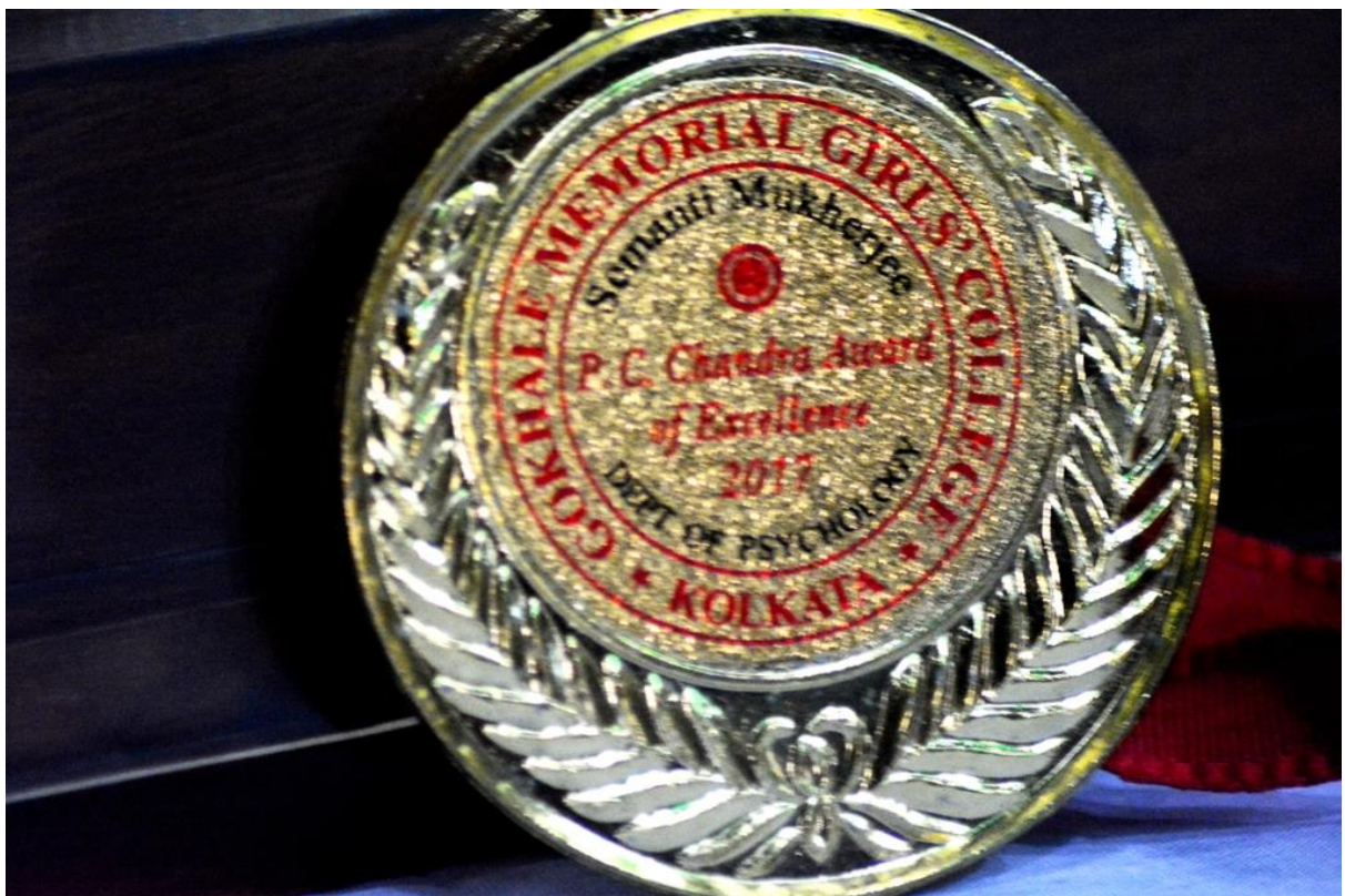
P.C. Chandra Award of Excellence