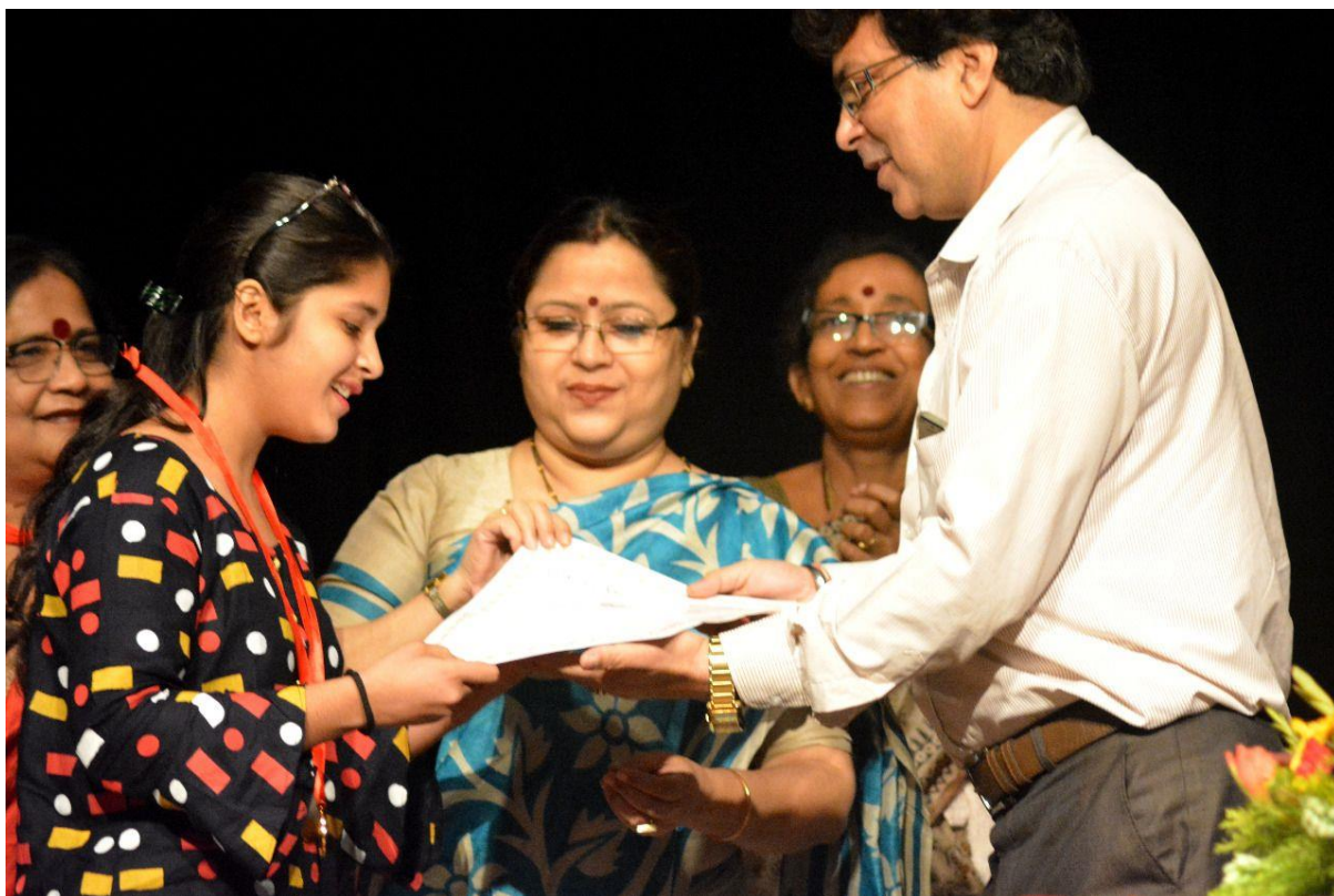
Annual Prize Distribution of GMGC