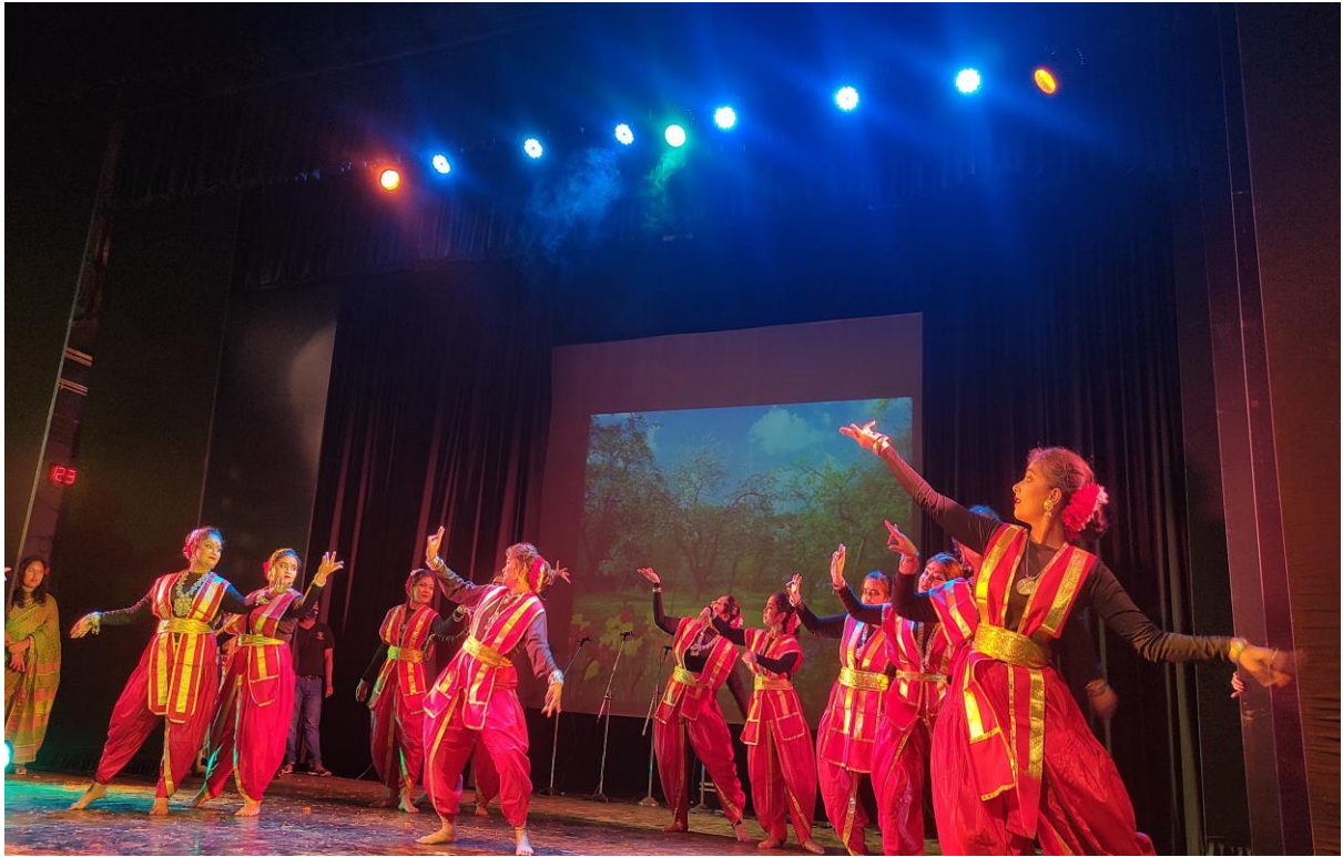
Moments of March, 2022