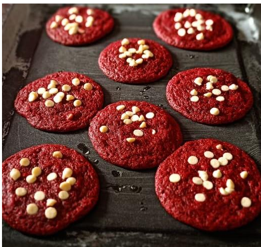
Red Velvet Cookies

23. 4/1/2023 Bakery Workshop organised by Alumni Association in collaboration with the Dept. 19 Students from various departments of college participated in the workshop. They were trained to prepared cakes and cookies.