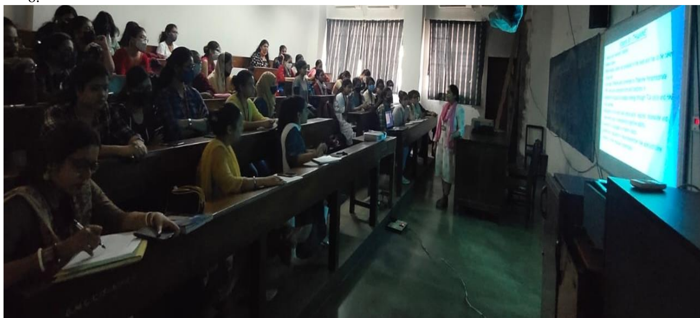
Students' Seminar Presentation