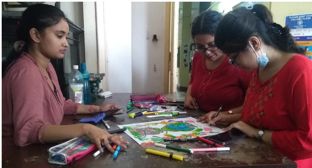
Earth day Participation