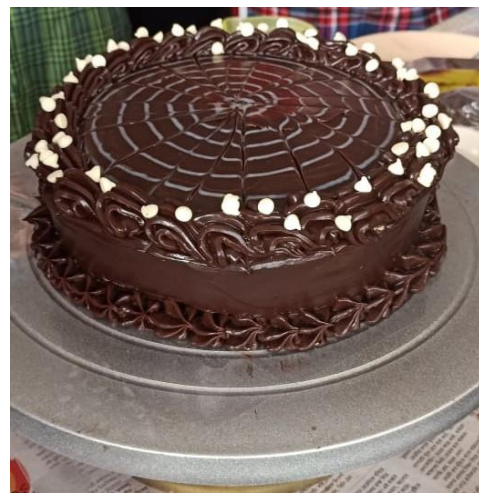
Chocolate Truffle Cake