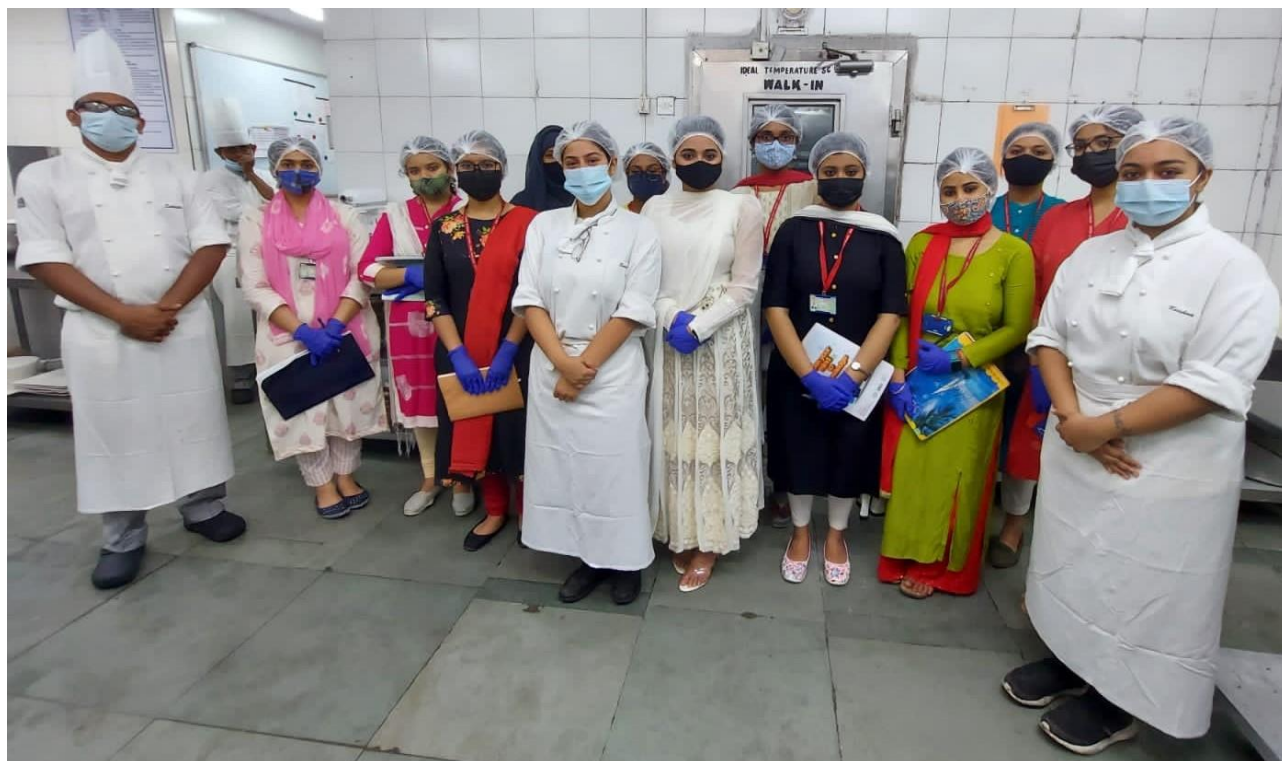
Field Visit to Taj Bengal Hotel