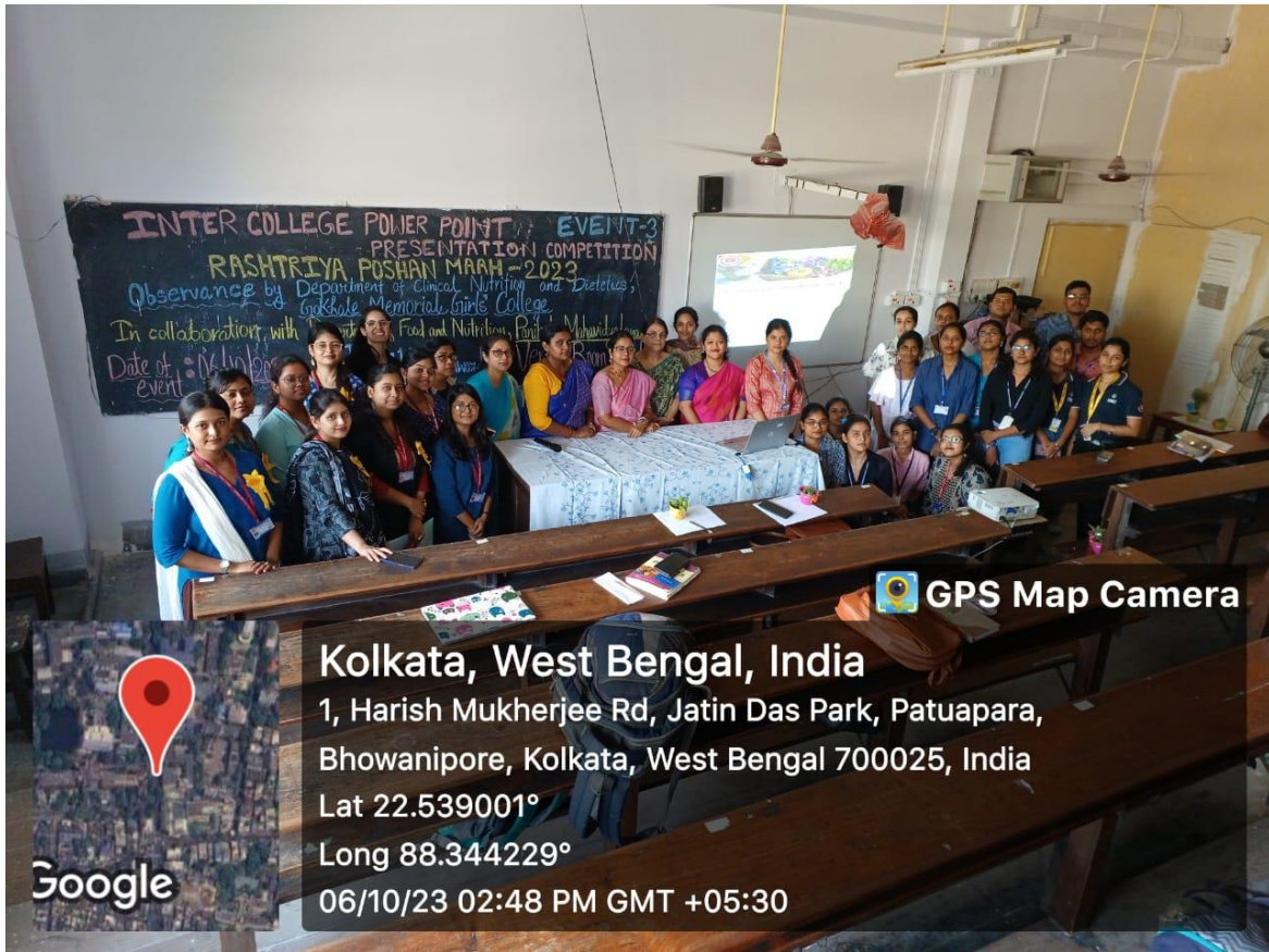
Group Photo with all Participants, Organizers & Judges.