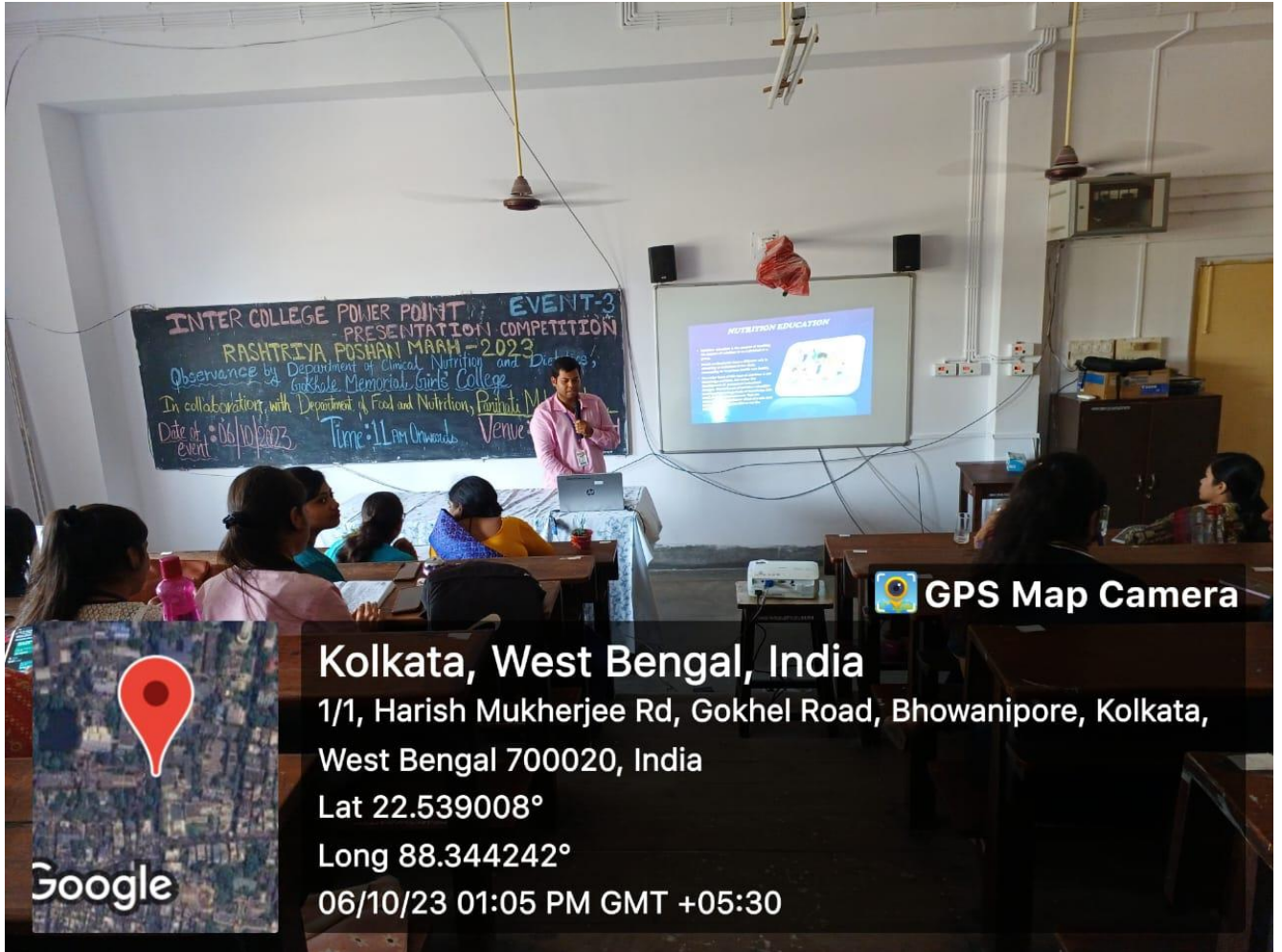
Power Point Presentation by a Participant