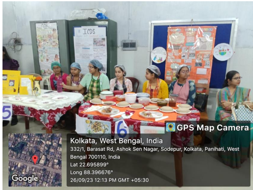
CNDV, GMGC Participating Students with their Food Items