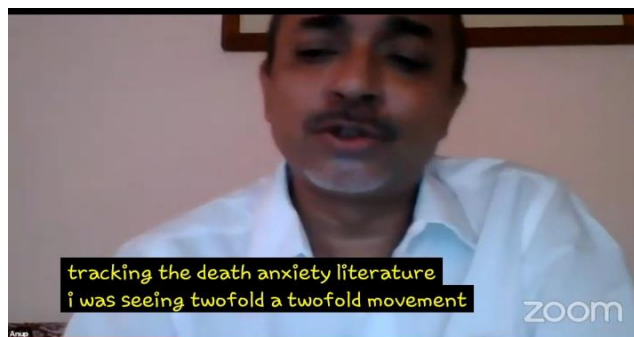
Psychological and Philosophical Perspectives to Death Anxiety