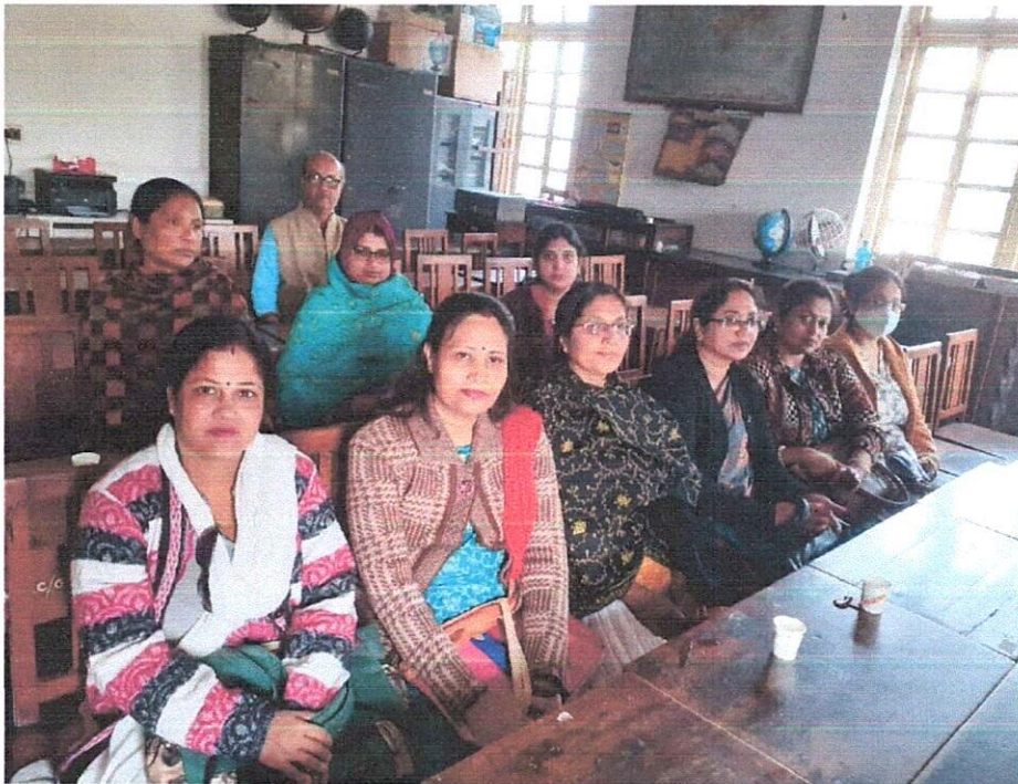
Parent –Teachers Meeting (Department of Geography)