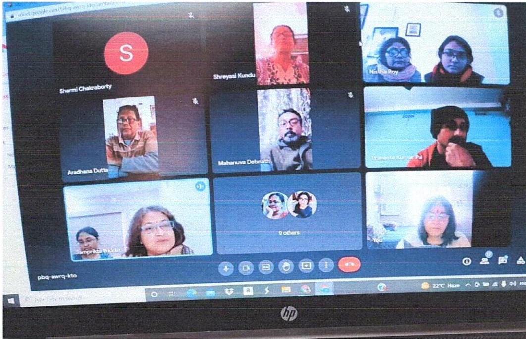
Parent-Teachers Meeting (Online)