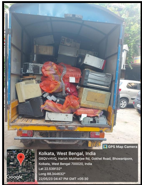
Collection and weighing of waste materials